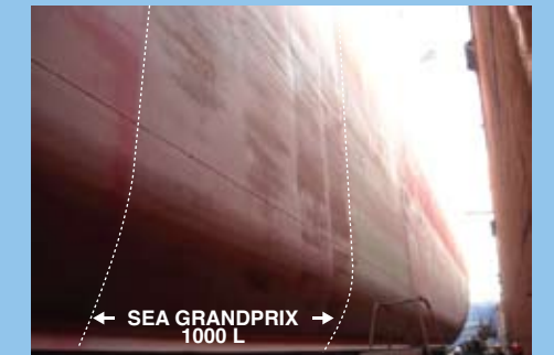
Type of vessel: Bulk Carrier