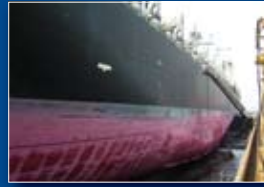
Arrival Condition of SEA GRANDPRIX 1000